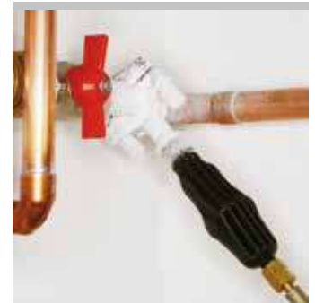
German Quality Product