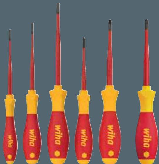
⊖ 3.5 / 4.0 / 5.5 ⊕ PH1 / PH2 ⊕ SL/PZ2 35446 35390 35391 35393 35394 36330