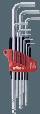
● 10 pcs. 1.5 / 2 / 2.5 / 3 / 4 / 5 / 6 / 8 / 10 07185