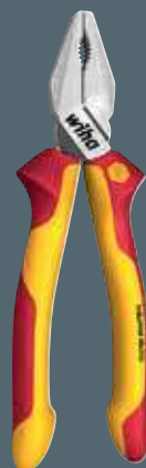
180 mm 33186